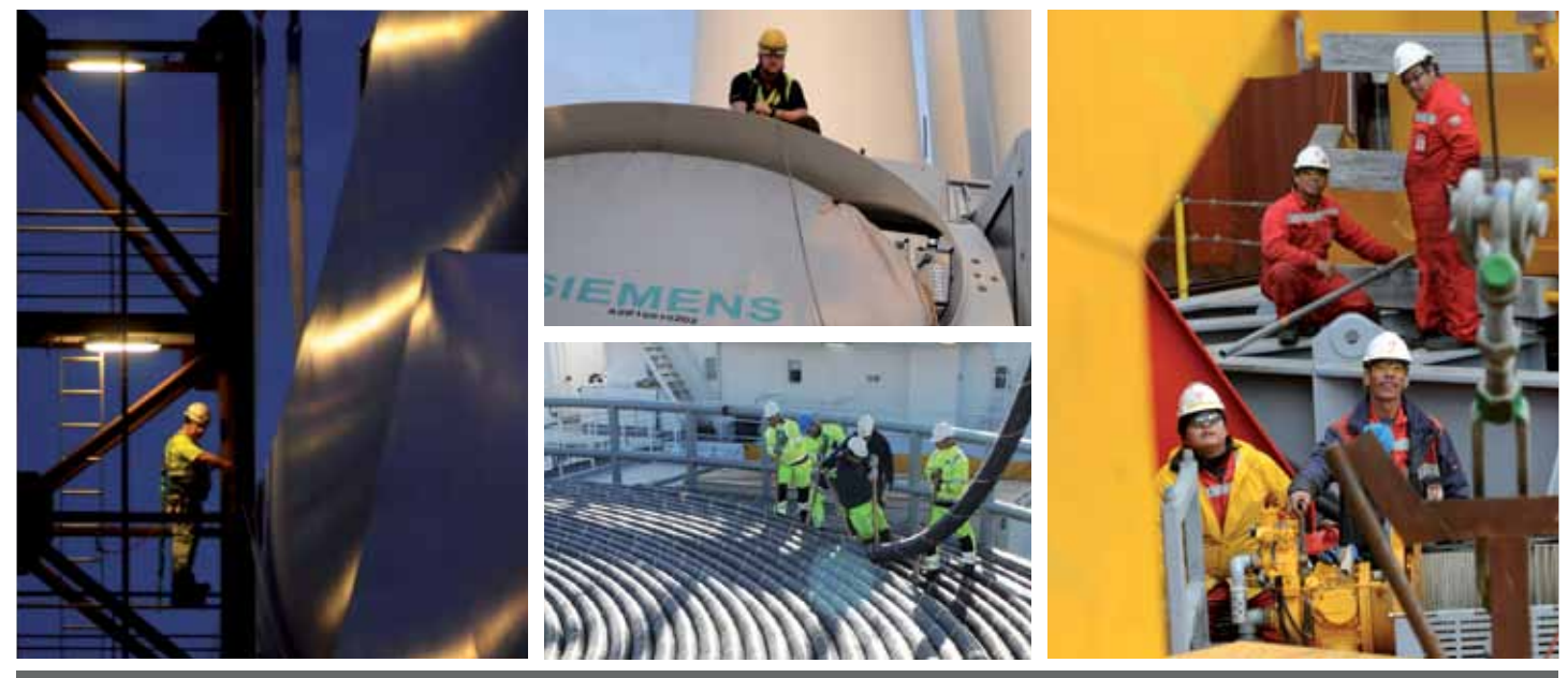
Experts from around the world have been called in to undertake the huge task of building the wind farm.

Each of the three phases of the Sheringham Shoal Offshore Wind Farm – development, construction and operation – have distinct requirements in terms of tasks and people with the skills to carry them out.